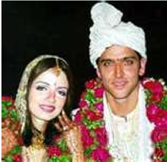
Rhitik Roshan – Susanne Khan